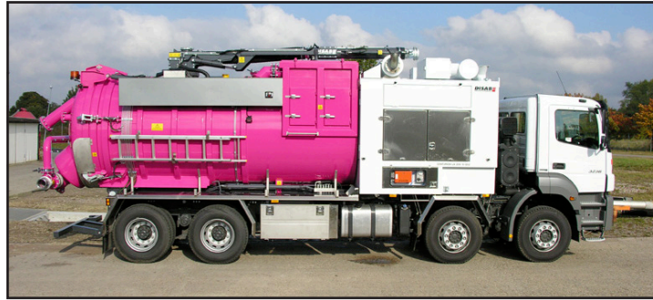
(This unit is equipped with options)